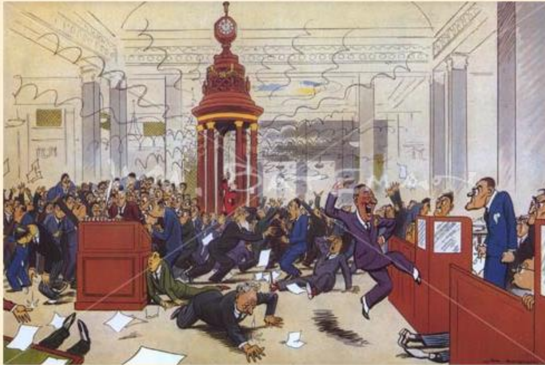
The Underwriter Who Missed the Total Loss (Showing the inside of Lloyd's, and the famous "Lutine" bell, which is rung to announce a total loss)